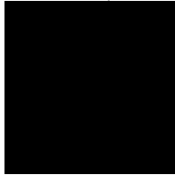
Matte White Lacquer - MWL